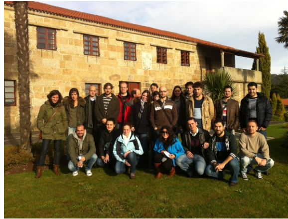
The first group of students on the Master's programme, 2012